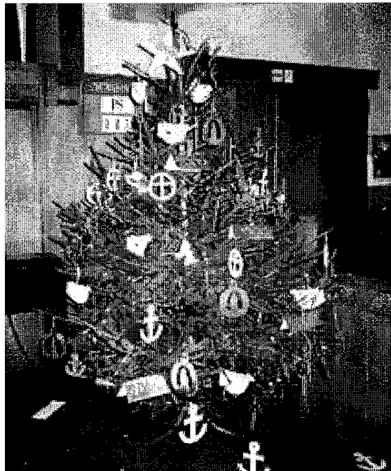
The Chrismon Tree